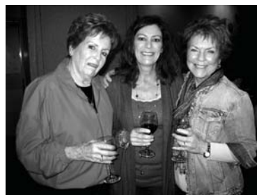
Cheers to fun, friends, and wine!