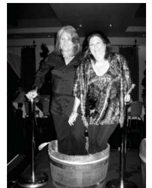
Thank you to all of our volunteers!